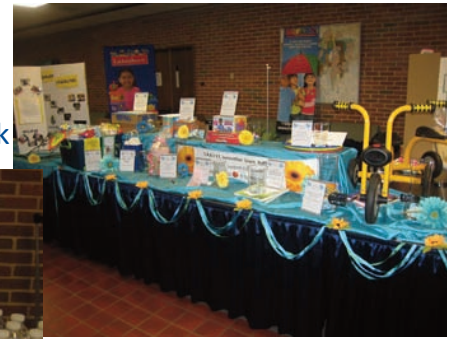
Corporate sponsors aid conference success